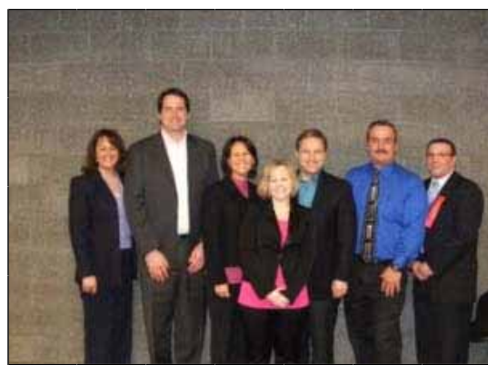
Photo of a recent General Membership Meeting at the Mat-su HBA.